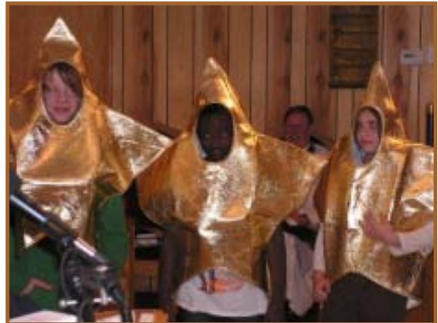
When we say we have "stars," we mean we have "stars!"