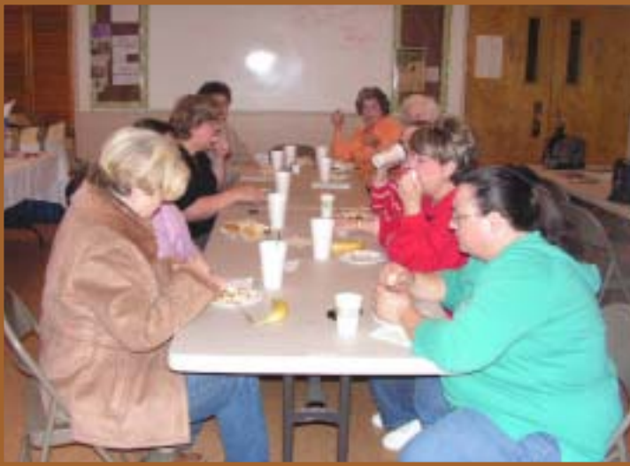
The women enjoy a bite to eat and some friendly fellowship before the meeting starts.