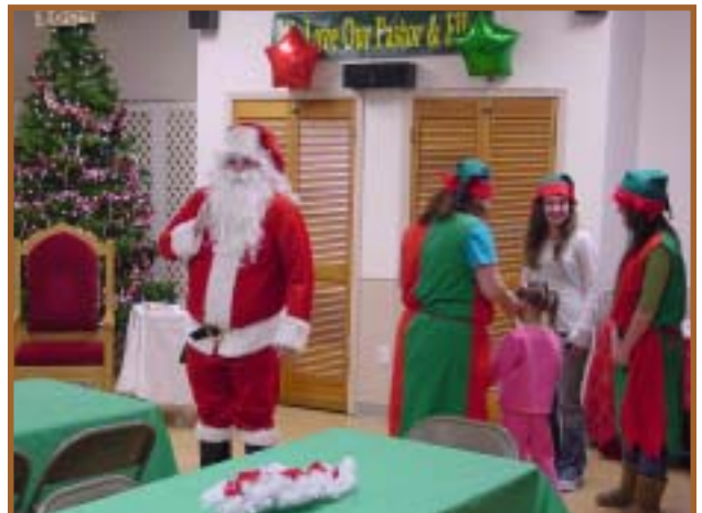
Santa Arrives! With a bag of toys and helpers in tow for his big day at Prince of Peace.

Before considering our motto for 2010, let us take a closing look at our motto for 2009. These words, "[r]emember