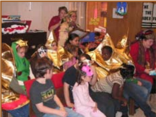
The cast is ready for the big production!