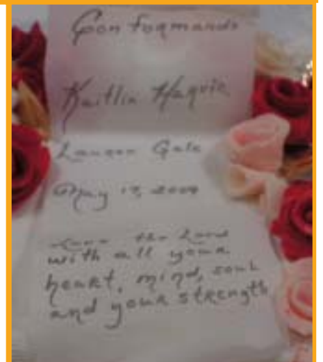
Right: The Scripture on the confirmation cake.