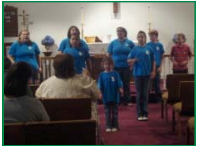
The Praise Team leads the worship at Faith in Greenville, Mississippi.

Vacation Bible School is just around the corner, July 27-31, 6-8 p.m. This is an important opportunity for Prince of Peace to plant seeds for God's kingdom in our community. We may not see the results but our actions impact the lives of children for years to come. Let us make Vacation Bible School extra special this year. Volunteers are needed to help with the program. Planning meetings will be held on Wednesday nights, July 8, 15, & 22, following our BBQ's. Again this year we are planning to give all attendees a backpack for school and a new pair of shoes. Donations are needed.