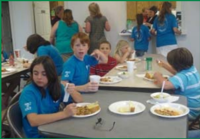
A bite to eat after a busy morning.