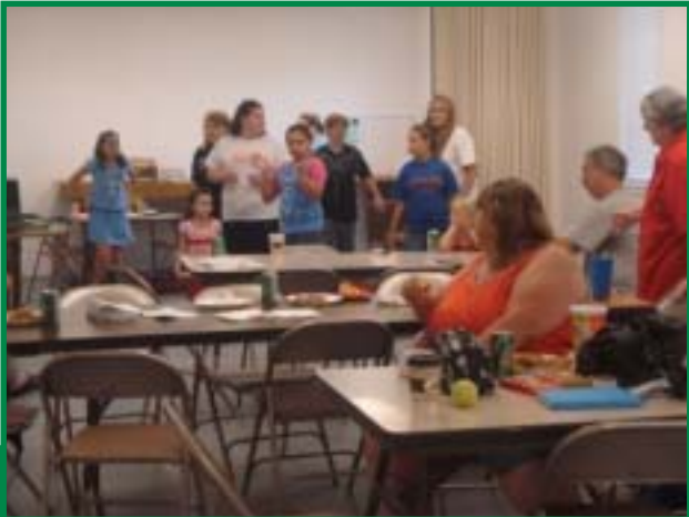
After a day of travel the Praise Team prepares to lead worship at Faith Lutheran Church.