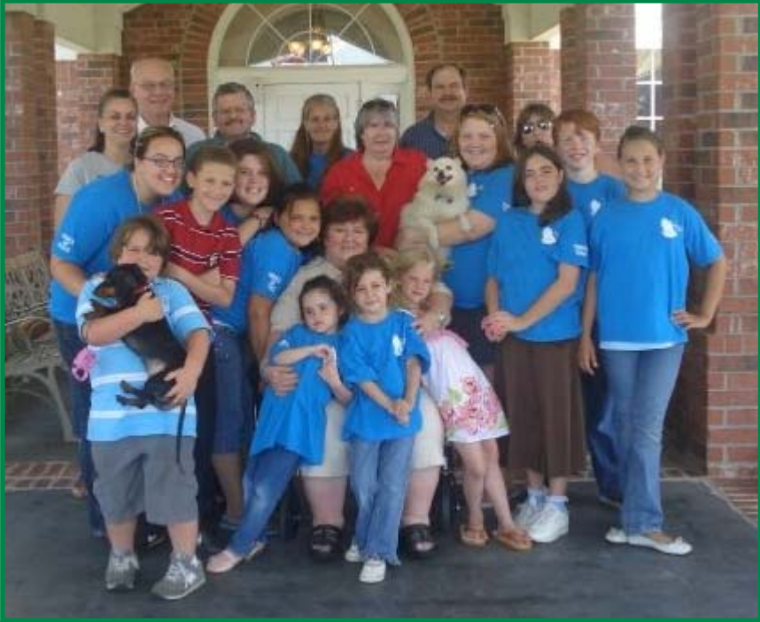
A happy Praise Team after a busy day already to head home.