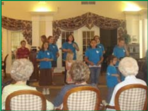
The Praise Team visits a nursing home in Greenville, sharing with its residents God's love.