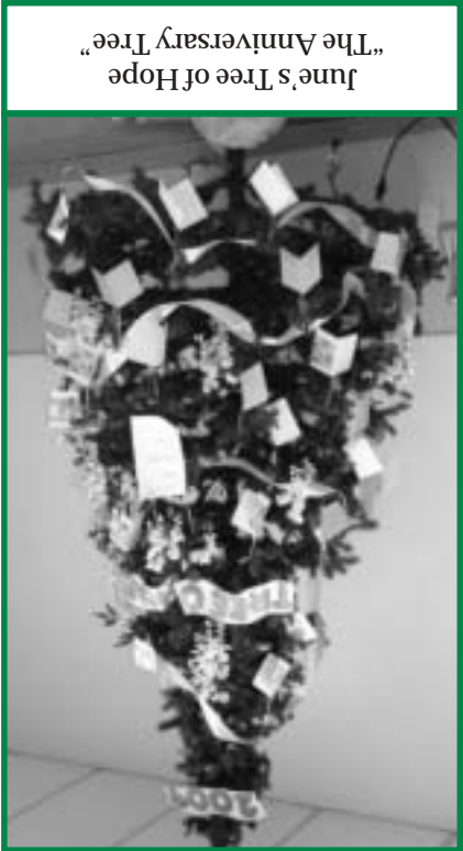
June's Tree of Hope "The Anniversary Tree"