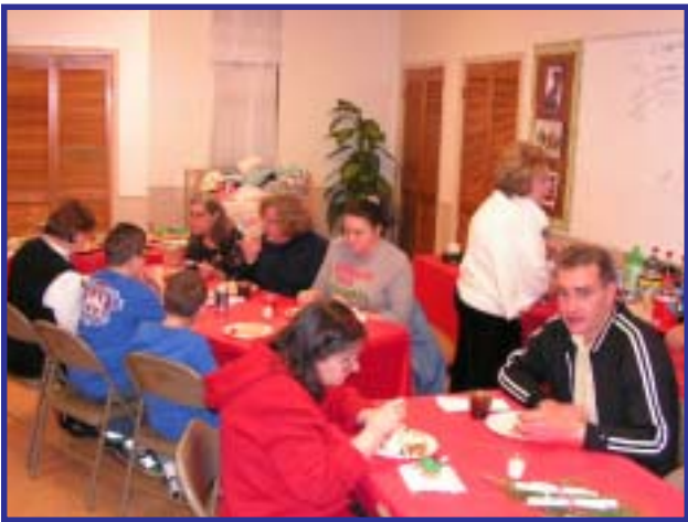
Left: Our members enjoying the delicious food at the Christmas Party.