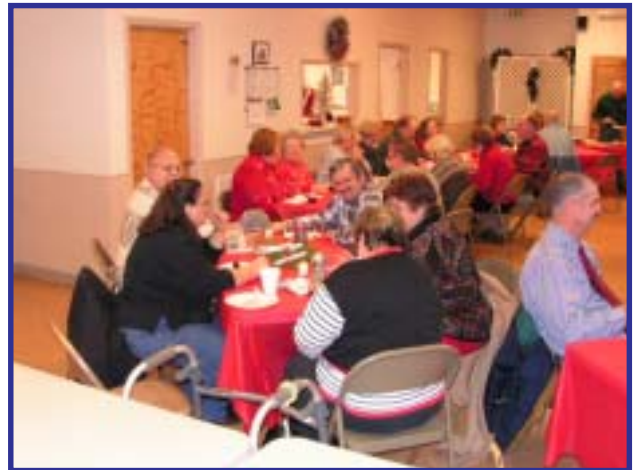
A memorable event in the making.