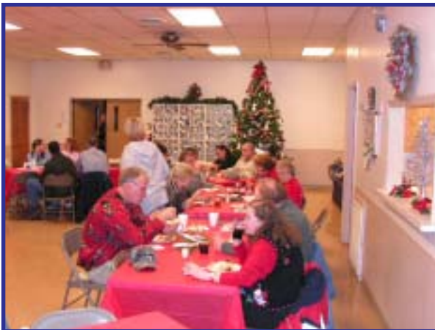
A wonderful time being had by all.